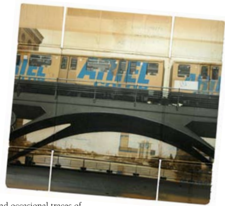
Wallflower, 2009 (top) Spray paint on cardboard 68 x 54cm

Working predominantly on bits of salvaged cardboard, EVOL's materials attest to his romantic preoccupation with the past and its untold stories. Small tears in the cardboard, exposed bits of corrugation, texts such as 'Fragile' and remnants of packing tape are incorporated into his compositions as visual signifiers of both the decay beholden to his urban subject matter and of his chosen material's previous function. We use cardboard to wrap up the by-products of our lives, accumulated moments, personal effects and tangible reminders of our youth. Entire histories