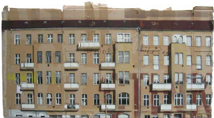
Wallflower, 2009 (facing page, right) Spray paint on cardboard 68 x 54cm