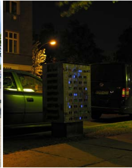
Plattenbauten, Alles wird Gut, 2008 (above, left) Spray paint on disused electrical cabinet, Berlin Dimensions variable